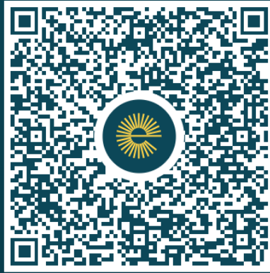
1 - Easy Fundraising QR Code. Support the PTFA while doing your online shopping!