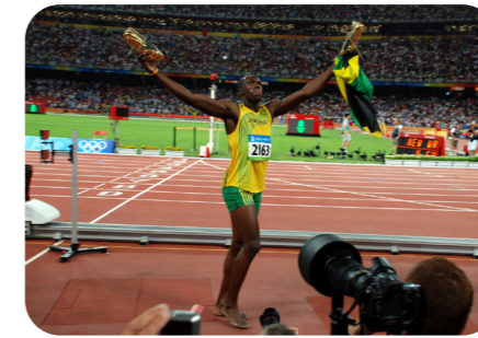
Usain Bolt broke the world record for the 100m sprint at the Olympic Games in 2008.

A world record is the best performance ever recorded in a specific skill or sport. World records are often set at the Olympic and Paralympic Games, when athletes are in peak physical condition. World records continue to be broken. This may be due to improvements in technology and equipment; athletes being able to train full time; improvements in medicine and physiotherapy or improved access to sports. Another important factor is state of mind, with top athletes demonstrating a high level of determination and motivation.