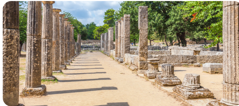
Ruins of Olympia in Greece

The first Olympic Games were held in Greece almost 3000 years ago in 776 BC. Only men could take part. Events included 200m and 400m races, wrestling, chariot racing, boxing and the pentathlon. The Games were held in a place called Olympia to honour the Greek god, Zeus, who lived on Mount Olympus. These Games took place every four years until AD 393.