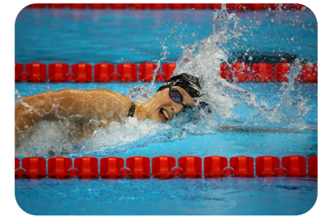
Katie Ledecky broke the world record for 800m freestyle swimming at the Olympic Games in 2016.