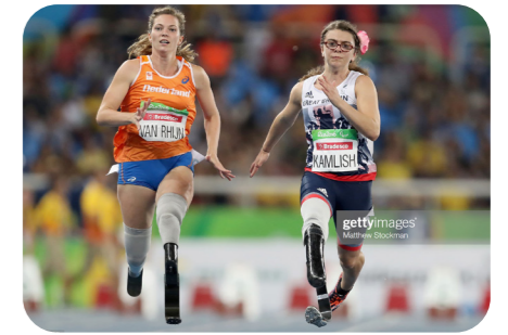
Sophie Kamlisch broke the world record for 100m at the Paralympic Games in 2016.