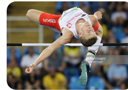
Maciej Lepiato broke the world record for high jump at the Paralympic Games in 2016.