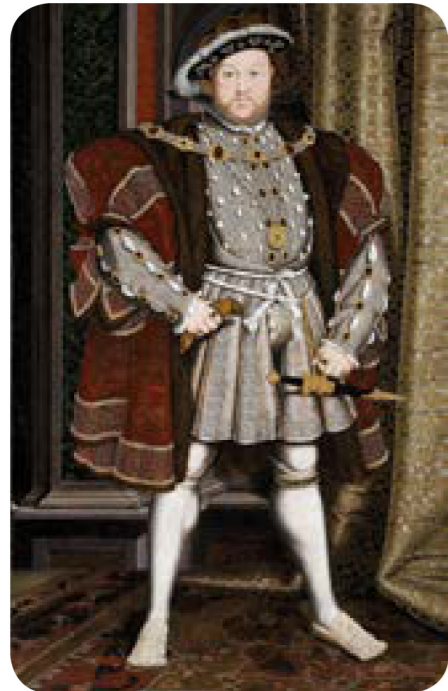
Henry VIII by Hans Holbein the Younger, 1537–47