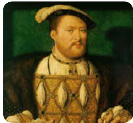
Portrait of Henry VIII by Joos van Cleve, c1530–1535

A portrait is a painting or photograph of a person. It usually shows their head and shoulders, but may show their whole body. Before cameras were invented, kings and queens often had official portraits painted to show how powerful and important they were.