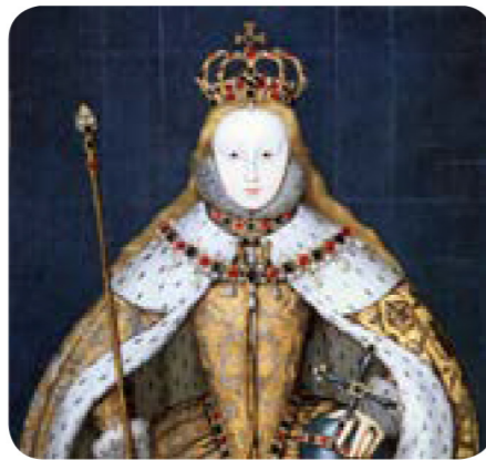
Coronation Portrait by unknown artist, c1600