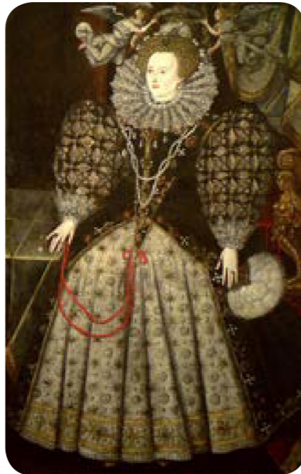
Portrait of Elizabeth I of England attributed to Nicholas Hilliard, 1590