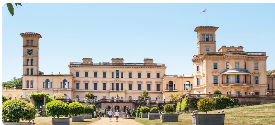
Osborne House is on the Isle of Wight, England.