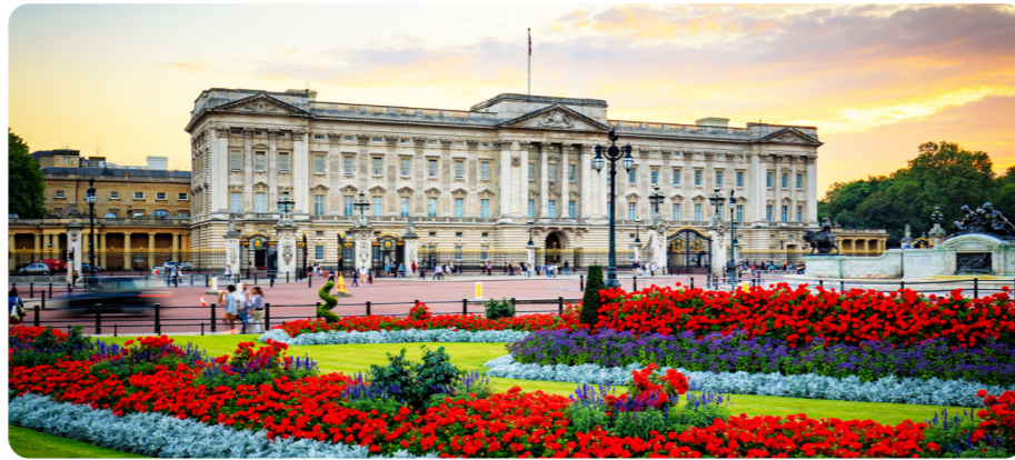
Buckingham Palace is in London, England.

Royal residences include palaces, castles and stately homes. Some of them are used for official royal business. Some are used as holiday or private homes. Many are tourist attractions.