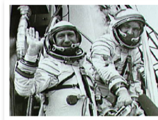
First spacewalk (USSR) Alexey Leonov March 1965