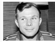
First human in space (USSR) Yuri Gagarin April 1961