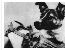
First animal in space (USSR) Laika the dog November 1957