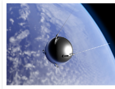
First satellite in space (USSR) Sputnik 1 October 1957

The Space Race was a competition between the Soviet Union (USSR) and the United States that took place in the 1950s and 1960s when the two countries were involved in a war called the Cold War. The main aim of the Space Race was to go into space and reach the Moon first. President of the United States, John F Kennedy, famously declared, 'We choose to go to the Moon!' By the end of the decade, both the USSR and the USA had invented the technology to make it possible. There were many exciting firsts during the Space Race.