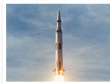
First manned spacecraft to orbit the Moon (USA) Apollo 8 December 1968