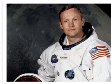
First person to step on the Moon (USA) Neil Armstrong July 1969