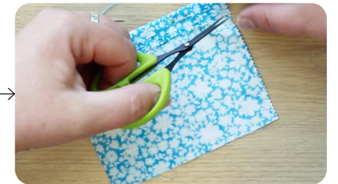
Tie a knot at the end of the hem and cut the thread. Iron along the crease to flatten the hem.