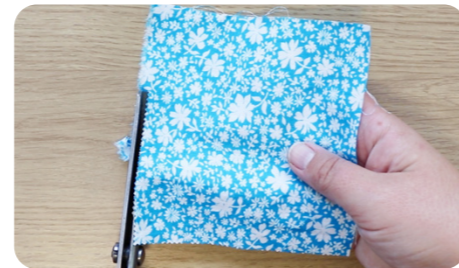
Trim the edge of the fabric with pinking shears.

A hem runs along the edge of a piece of cloth or clothing. It is made by turning under a raw edge and then sewing to give a neat finish to the fabric and to stop it from fraying.