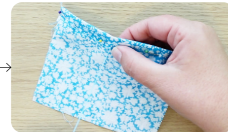
Use a needle and thread to sew running stitches along the hem.