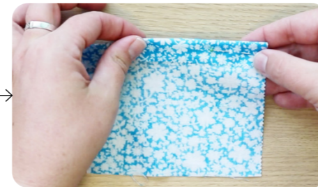
Turn the edge of the fabric over to make a 1.5cm hem. Pin it in place.