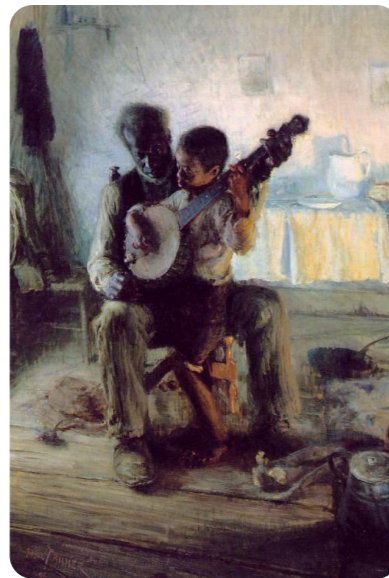
The Banjo Lesson

The Banjo Lesson (1893) by Henry Ossawa Tanner shows an elderly man teaching a young child the banjo, symbolising the resilience, intellect and caring nature of the once enslaved African American people.