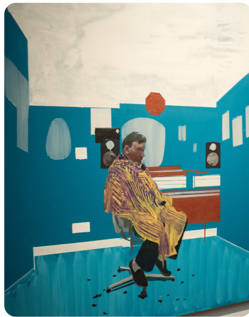
Peter's Sitters 3

Peter's Sitters 3 (2009) by Hurvin Anderson connects his Caribbean heritage with life in England. Colour symbolises his Caribbean heritage, while the barbershop symbolises an important aspect of life in England to Afro-Caribbean immigrants.