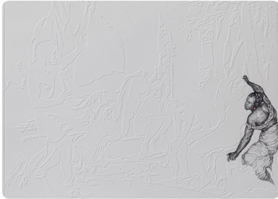
Vanishing Point 7