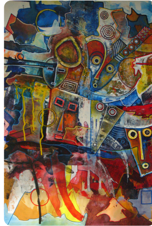
Another Call from Africa

Another Call from Africa (2009) by Turgo Bastien uses bright colours and African masks to celebrate African culture. Masks play an important spiritual and religious role in African societies and are therefore a significant feature within Turgo Bastien's work.