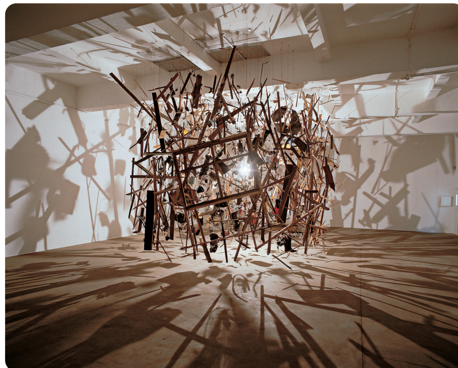
Cold Dark Matter: An Exploded View by Cornelia Parker, 1991