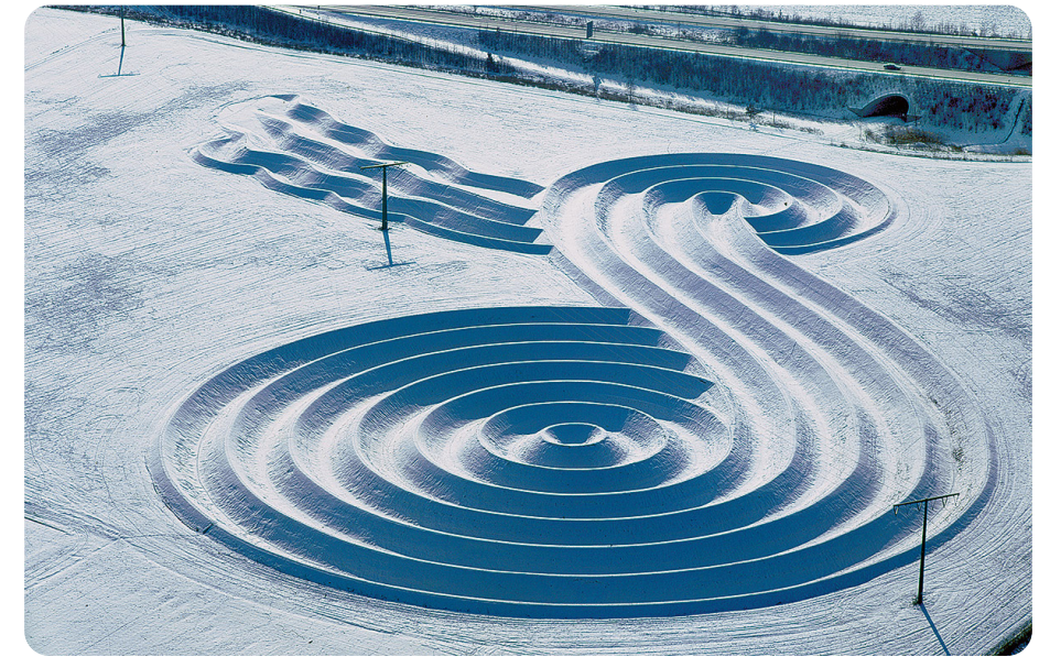
Earth Sign by Wilhelm Holderied, 1995

A relief sculpture projects from a flat surface. A high relief sculpture clearly projects out of the surface and looks like it is freestanding. A low relief, or bas-relief, sculpture does not project far out of the surface and is visibly attached to the background.