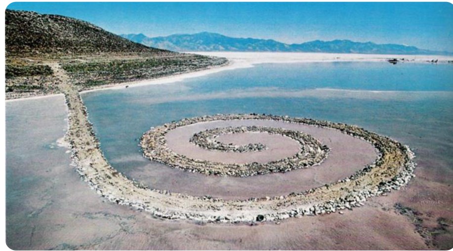
Spiral Jetty by Robert Smithson, 1970

Land art, or Earth art, is art that is made within the landscape. Land art is usually captured using photography because it is temporary and often made on a large scale.