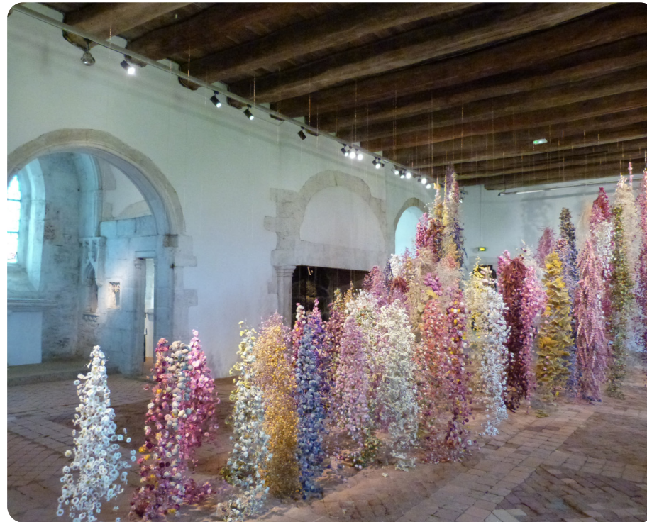
Banquet by Rebecca Louise Law, 2019

Some land artists bring materials inside from the outdoor environment to create installations in galleries and exhibition spaces.